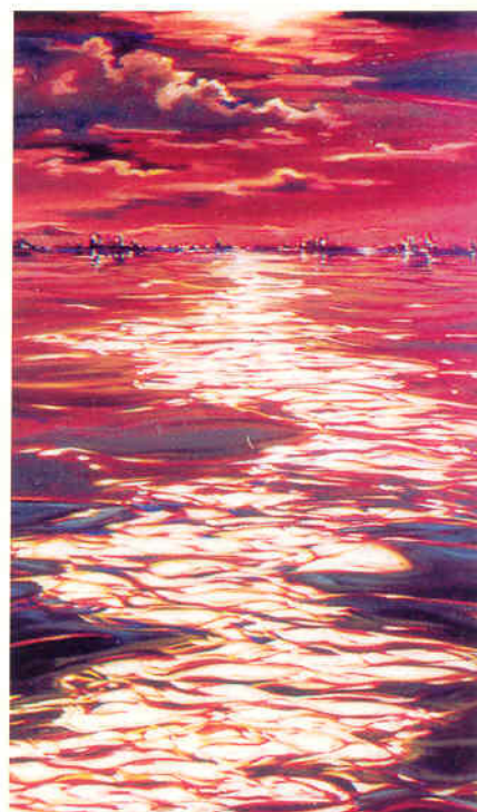
"Gold Moon Blue City" 36 x 60 oil

Elena says for her an experience becomes an emotional and liberating